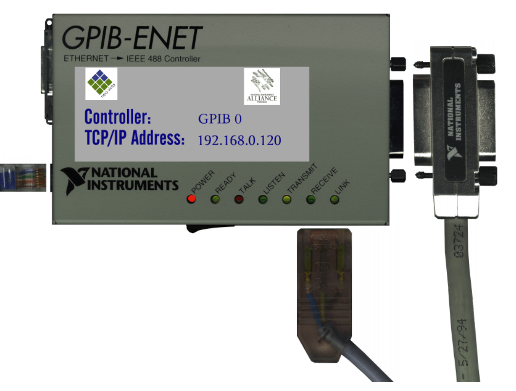
Figure 2 GPIB-ENET System

The System Registry holds all critical data pertaining to the system. An Interval Timer communicates to each NED via its own separate GPIB driver, ensuring that there are no clashes with any other NED under normal conditions. The results from each NED are passed back to this GPIB driver and then fed into a Results Monitor queue where the data is processed for a number of conditions. If any error occurs in the return data it activates a Self Heal system, which remains in constant communication with the appropriate NED until the problem, has been resolved. While this is occurring, the appropriate register is set to ensure that the GPIB driver is taken offline and only